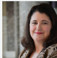
Zahra Karinshak State Senate District 48