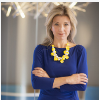
Sen. Jennifer Jordan State Senate District 6